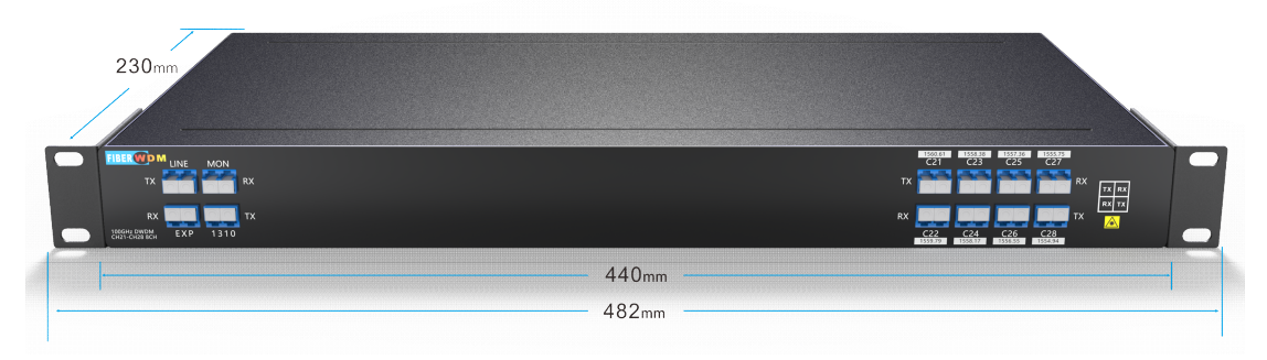
19" Inch 1U Rack