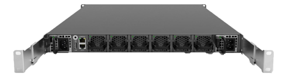
DS610 rear view